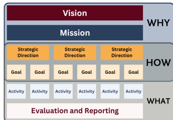
Fast Forward Libraries' Strategic Planning Model