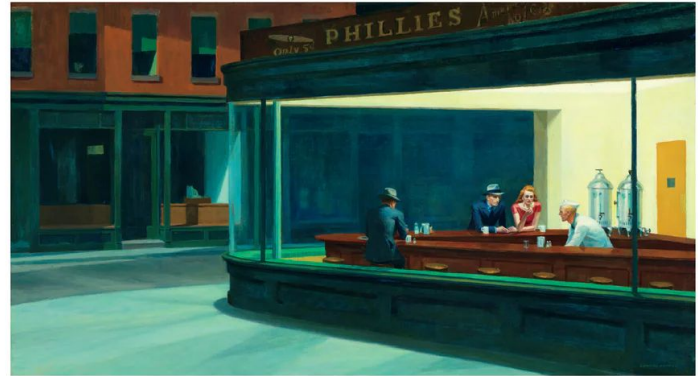
Edward Hopper (American, 1882-1967), Nighthawks , 1942, Oil on Canvas, 84.1 x 152.4 cm (33 1/8 x 60 in.), Friends of American Art Collection, 1942-51, The Art Institute of Chicago. All Rights Reserved.