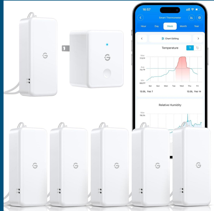
GoveeLife 2.0 WiFi Hygrometer Thermometer